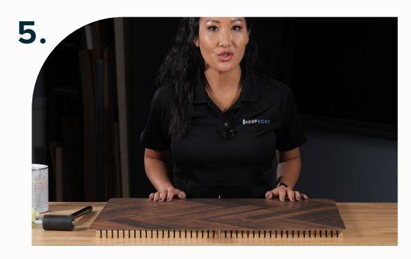
Trim edges using a router.