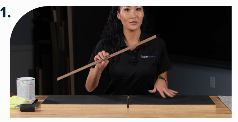
Align kerfs using a piece of 1/8" hardboard between the two pieces. No gluing is required, the decorative surface will hold the materials together.