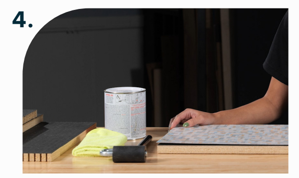
Apply pressure to ensure good adhesion.

FLEX EDUCATION SERIES Soflex<sup>™</sup> Splicing Without Fastners (Additional Height)