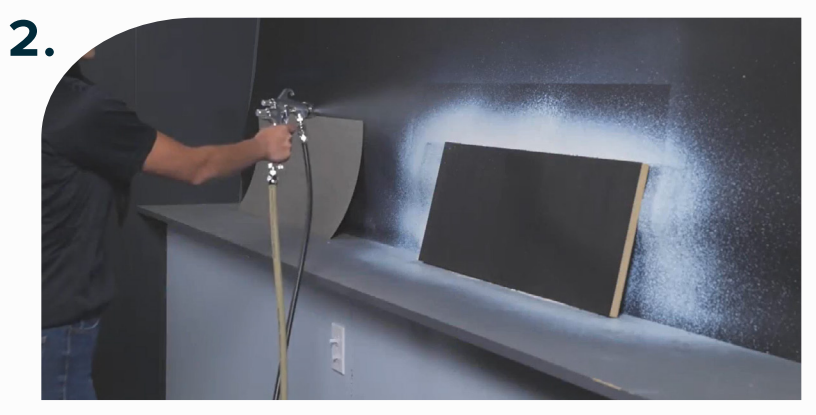
Apply adhesive to both the decorative surface and the Soflex faces.