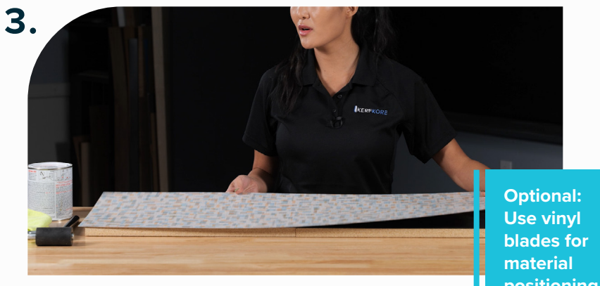
Apply decorative surface.