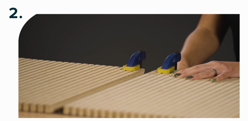
Butt or overlap and under scribe decorative surface seam.