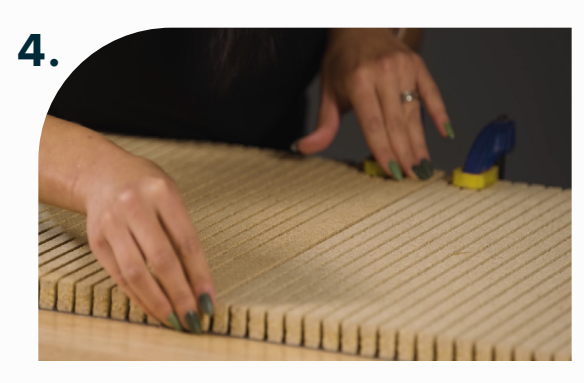
Place seam rib over seam, maintain a 1/8" gap on either side, press and hold.