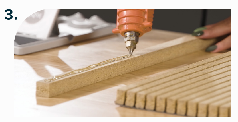
Cut a <sup>3</sup>/<sub>4</sub>" wide seam rib from solid wood or particleboard. Apply adhesive to seam rib.