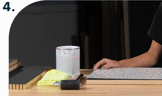
Apply pressure to ensure good adhesion.