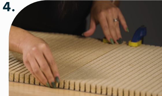
Place seam rib over seam, maintain a 1/8" gap on either side, press and hold.