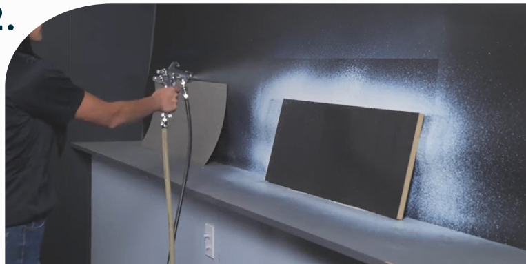
Apply adhesive to both the decorative surface and Soflex substrate.