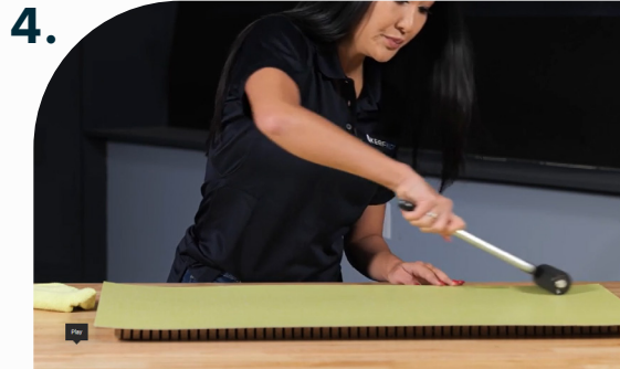
Apply pressure to surface to ensure good adhesion.