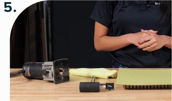
Trim edges using a router.