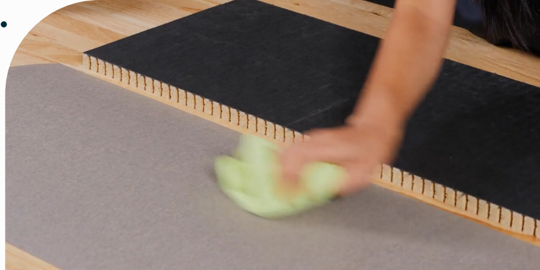
Clean the surfaces by removing all dust and debris.