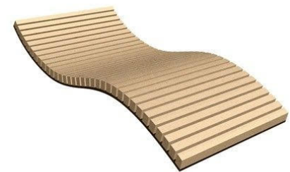
96" x 48" Barrel Bend