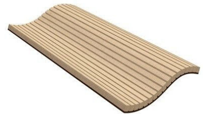
48" x 96" Column Bend