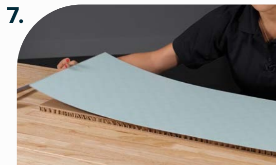
Apply decorative surface to Worklite.