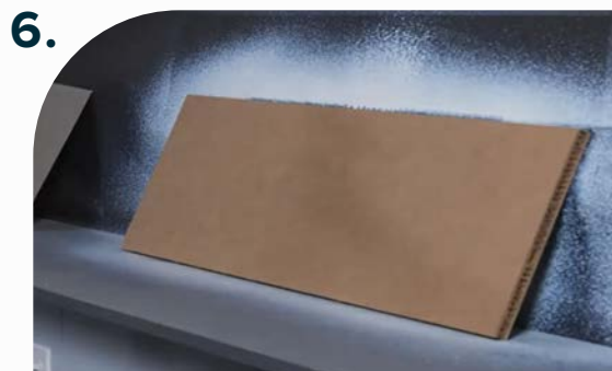
Apply adhesive to both the decorative surface and Worklite.