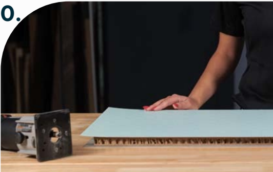
Trim edges using a router.