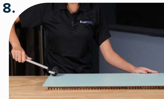
Apply pressure to surface to ensure good adhesion.