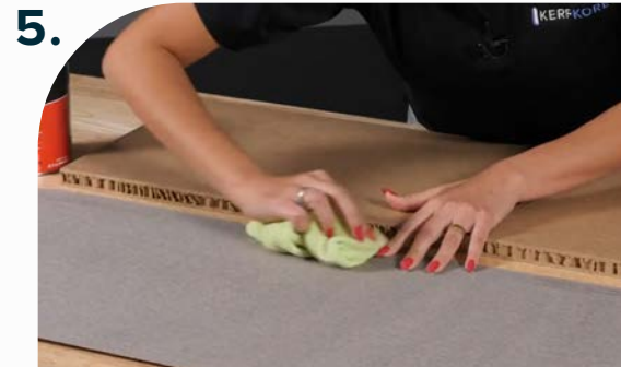
Flip the panel over to laminate other side. Clean the surfaces by removing all dust and debris.