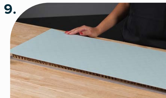
Both sides of Worklite panel are now laminated. This creates balance and avoids warping.