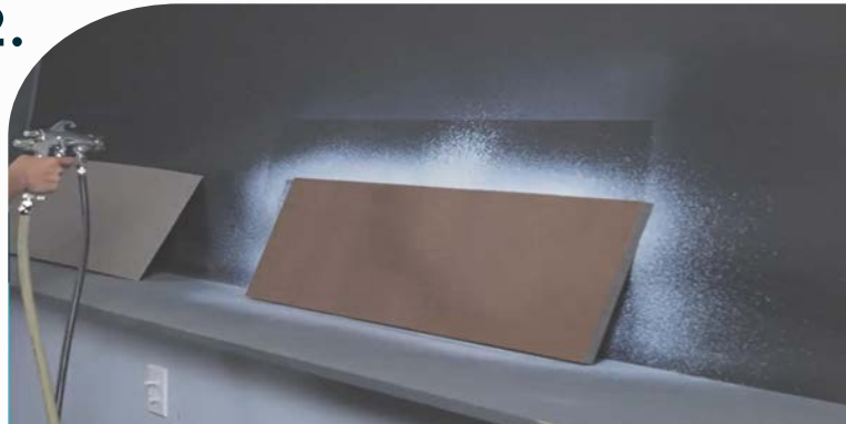
Apply adhesive to both the decorative surface and Worklite.