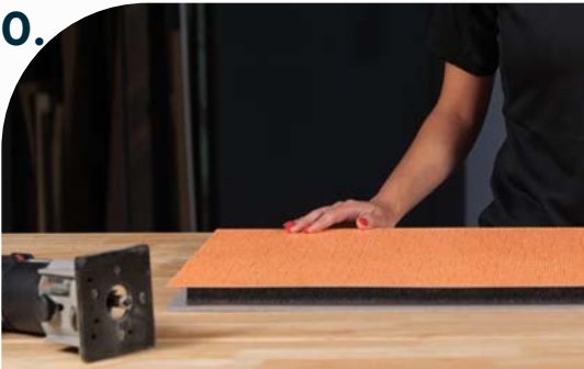
Trim edges using a router.