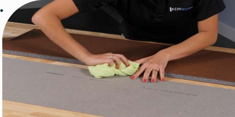
Clean the surfaces by removing all dust and debris.