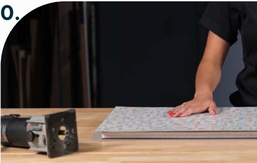
Trim edges using a router.