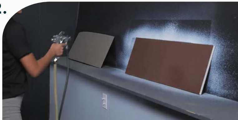
Apply adhesive to both the decorative surface and Worklite.