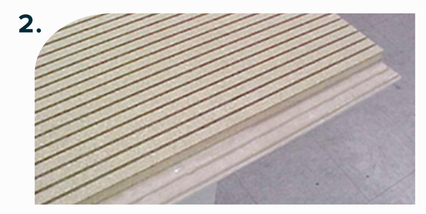
Panel is ready for inset attachment. (Optional: Dado)

Use a blade to remove the necessary core ribs to allow a tight inset attachment to framework.