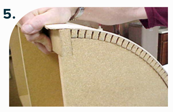
Press pre-sized and pre-cut panel to framework.