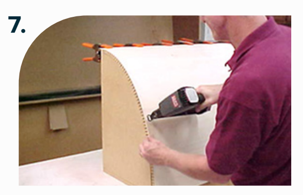
Staples can be used on the outside face along ribbing. Face is now ready for lamination.

Congratulations! Your project is complete, but this is just the beginning of opportunities with our Kerfkore products.