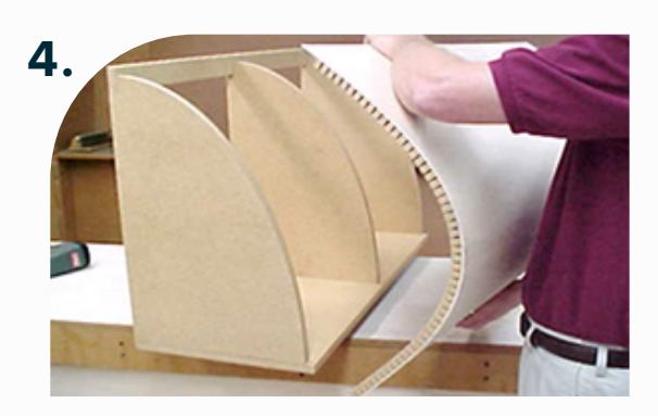
Position the panel.