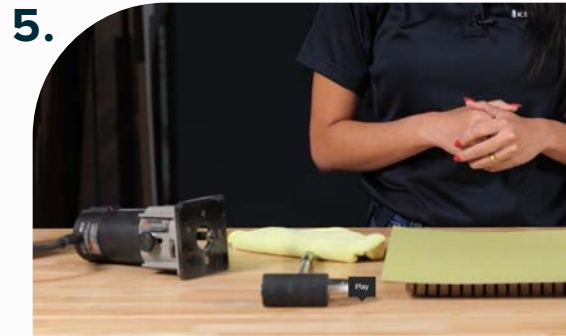
Trim edges using a router.