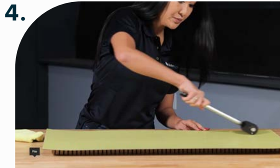
Apply pressure to surface to ensure good adhesion.