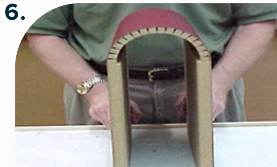
Form to desired radius.

Congratulations! Your project is complete, but this is just the beginning of opportunities with our Kerfkore products.