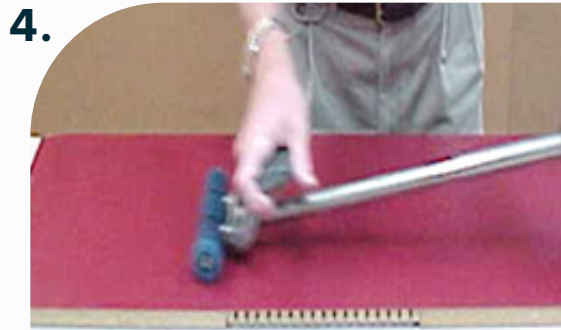
Apply pressure with a J-Roller to ensure good adhesion.