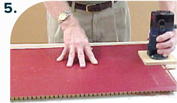
Trim edges using a router.