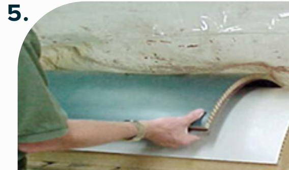
Place veneer face down on form. Then, place Kerfkore with glued rib side down onto veneer.