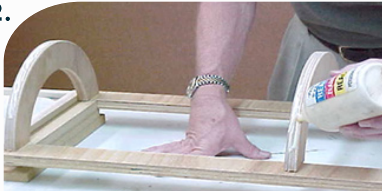
Apply PVA/White glue adhesive outside face of horizontal ribs.