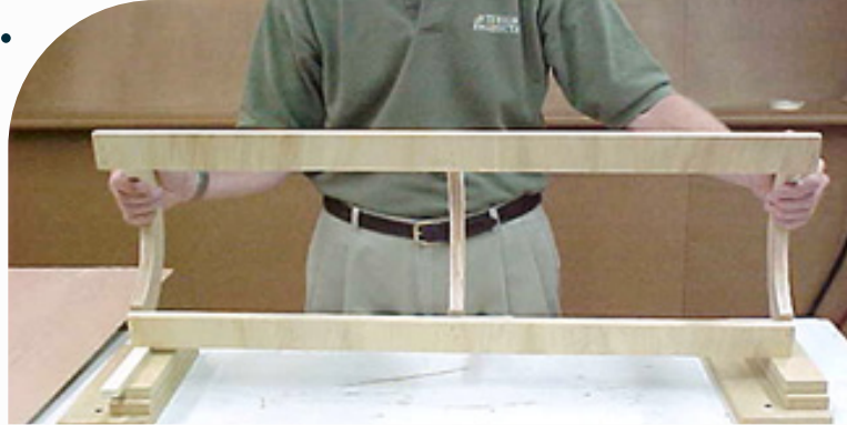
Outfit frame using horizontal ribs.