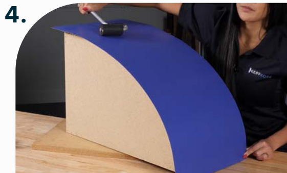
Use a J-Roller to ensure uniform adhesion.