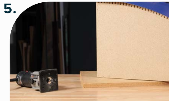
Use a router to remove excess material from edges.