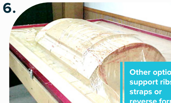
Vacuum press until dry.