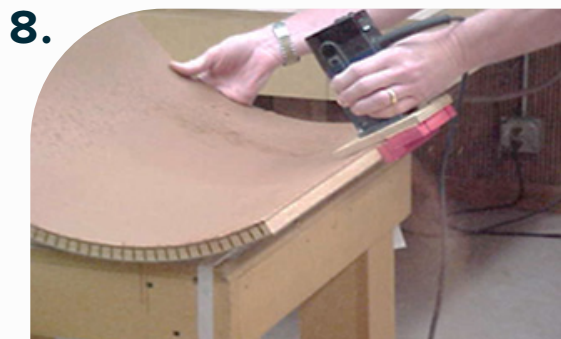
Trim excess material from edges.