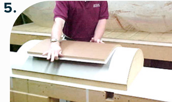
Place over the form and prepare for pressing.