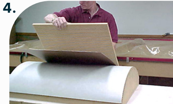
Match the two panels together.