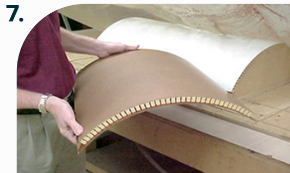
Remove from press.