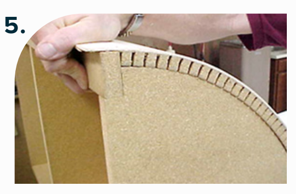
Press pre-sized and pre-cut panel to framework.