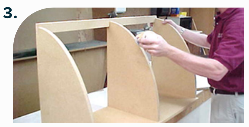
Apply glue to horizontal ribs.