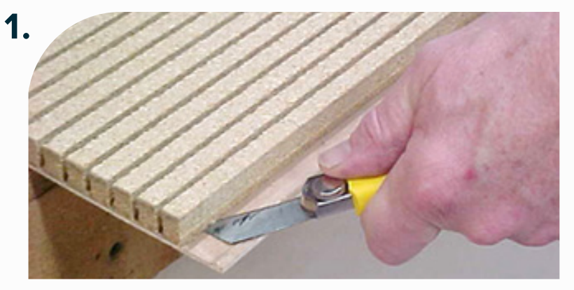
Use a blade to remove the necessary core ribs to allow a tight inset attachment to framework spacing.