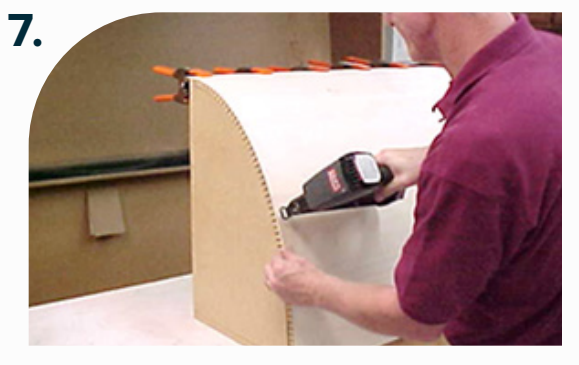
Staples can be used on the outside face along ribbing. Face is now ready for lamination.

Staple and clamp ends to secure attachment between panel and framework.