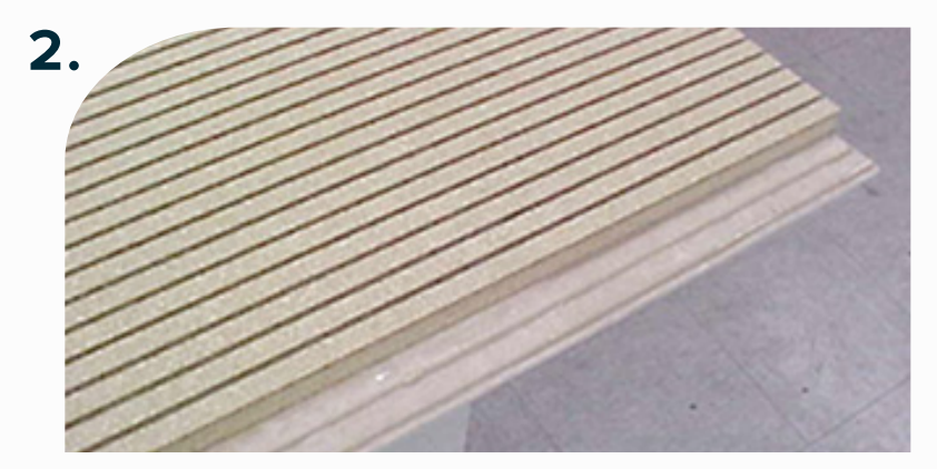
Panel is ready for inset attachment. (Optional: Dado)