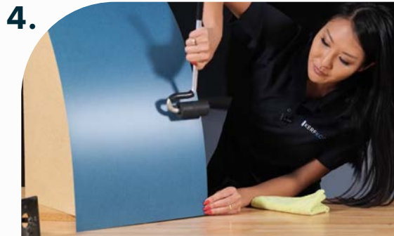
Use a J-Roller to ensure uniform adhesion.