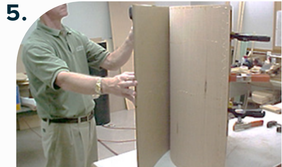
Apply PVA/Wood glue to the back side of the Econokore panel and attach to the plywood panel.