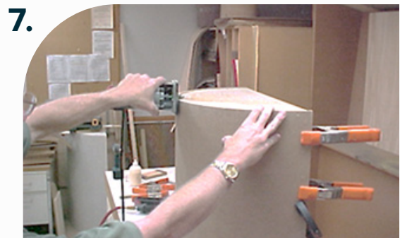
Hold in place until dry. Use a router to remove excess material.